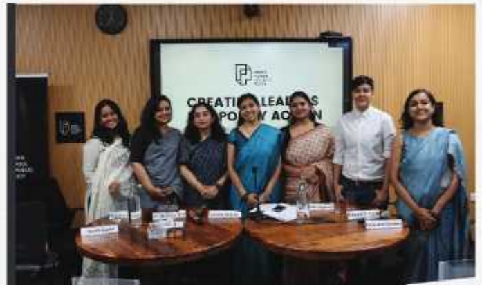
Women in Public Policy initiative at ISPP