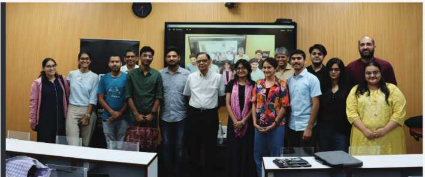
Arvind Panagariya, the Former Vice Chairman of NITI Aayog with ISPP scholars